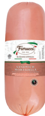
SANDWICH MORTADELLA #50456

Crafted in the fine Italian style, this mortadella uses select cuts of meats that are blended with imported spices and slow-roasted—giving it a soft, buttery mouth feel and flavor. Fiorucci Mortadella is available with or without pistachios.